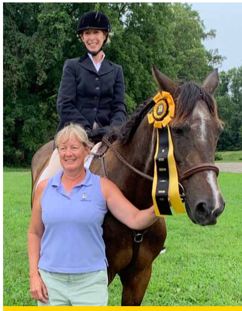
Page Lyon: 73 | Albert: 28 | Combined: 101

Albert is infamous for escaping from his stall at Morven Park in Leesburg, Virginia, during