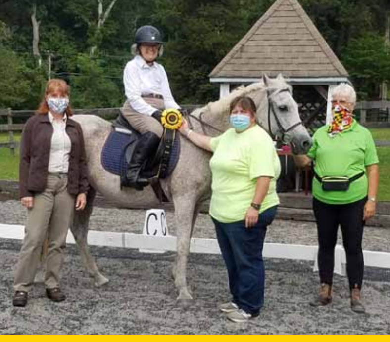
Virginia Streamer: 80 | Atlantis: 25 | Combined: 105

When I heard about the Icelandic ponies and saw the tölt on YouTube, I decided that