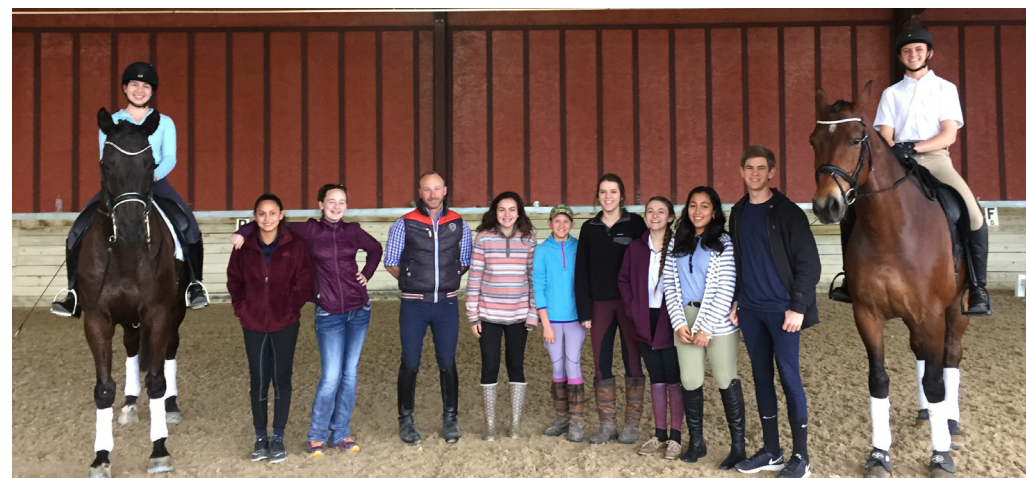
Alamo Dressage Association— Recipient of a Violet Hopkins Fund Grant for GMO Events

“Training in Germany with the Carol Lavell Advanced Dressage Prize was more than amazing! Sanceo and I learned so much every day and made the most of the experience. We spent a great deal of time working on the basics, balance and biomechanics, which really improved our strength necessary for Grand Prix. The Prize gave me the opportunity to fully focus on the training and development of this special horse.”